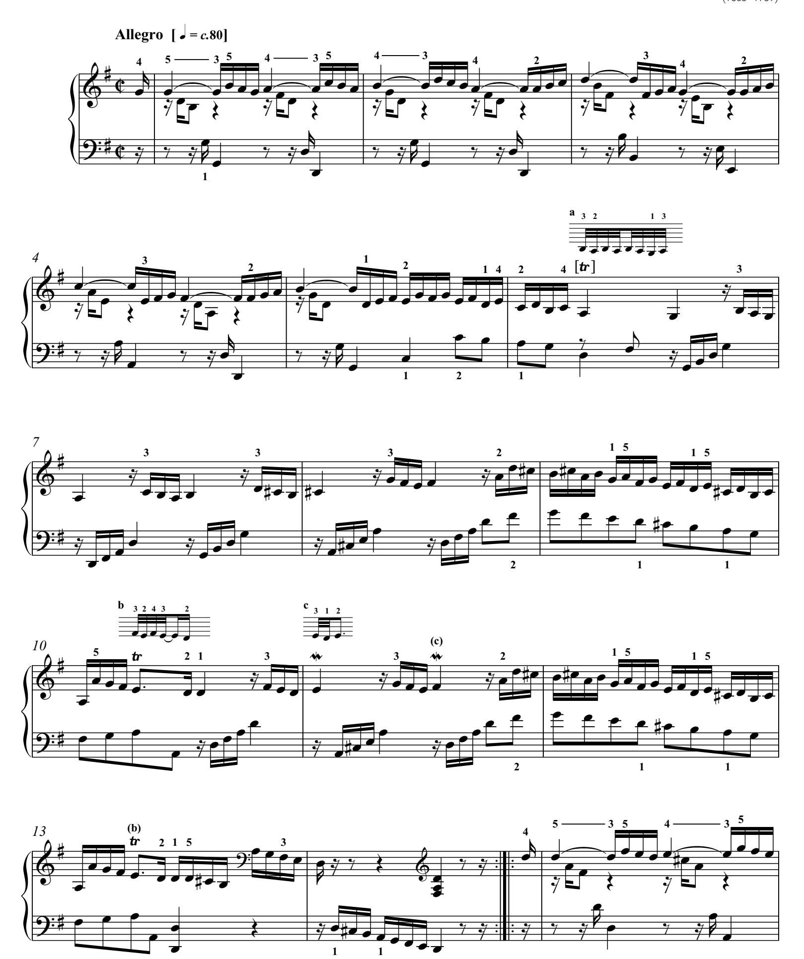
Play smoothly and expressively, holding notes for their full value. The cadential chords may be arpeggiated.